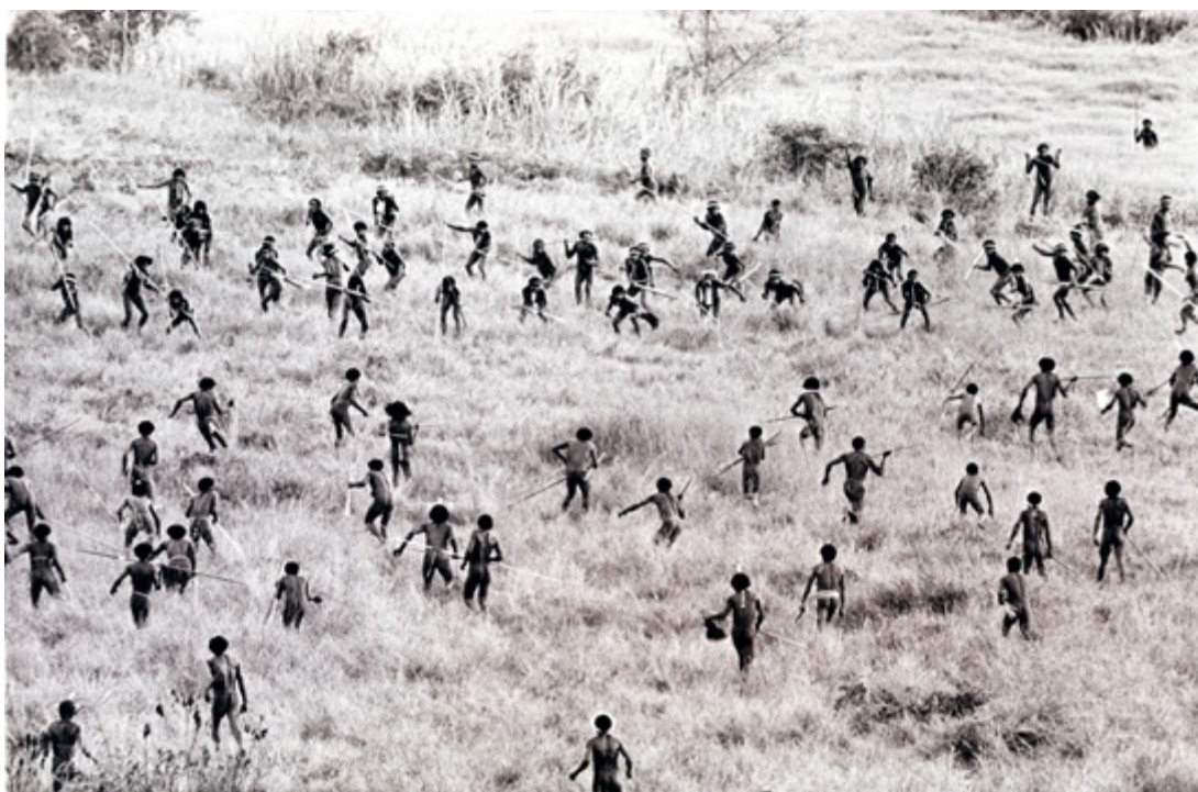
12. Tribal warfare in New Guinea between two farming communities (1960). Such scenes were probably widespread in the thousands of years following the Agricultural Revolution.

Nor could wheat offer security against human violence. The early farmers were at least as violent as their forager ancestors, if not more so. Farmers had more possessions and needed land for planting. The loss of pasture land to raiding neighbours could mean the difference between subsistence and starvation, so there was much less room for compromise. When a foraging band was hard-pressed by a stronger rival, it could usually move on. It was difficult and dangerous, but it was feasible. When a strong enemy threatened an agricultural village, retreat meant giving up fields, houses and granaries. In many cases, this doomed the refugees to starvation. Farmers, therefore, tended to stay put and fight to the bitter end.