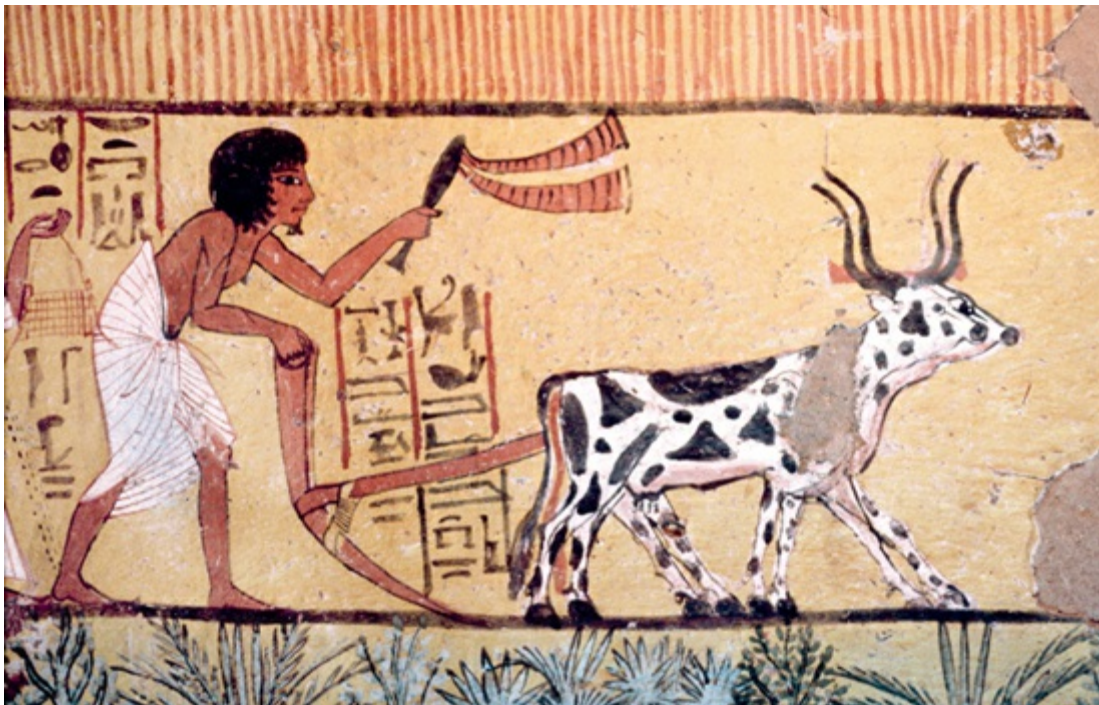
14. A painting from an Egyptian grave, c.1200 BC: A pair of oxen ploughing a field. In the wild, cattle

In order to turn bulls, horses, donkeys and camels into obedient draught animals, their natural instincts and social ties had to be broken, their aggression and sexuality contained, and their freedom of movement curtailed. Farmers developed techniques such as locking animals inside pens and cages, bridling them in harnesses and leashes, training them with whips and cattle prods, and mutilating them. The process of taming almost always involves the castration of males. This restrains male aggression and enables humans selectively to control the herd's procreation.