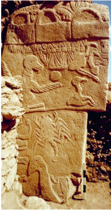
13. Opposite: The remains of a monumental structure from Göbekli Tepe. Right: One of the decorated stone pillars (about five metres high).

Why would a foraging society build such structures? They had no obvious utilitarian purpose. They were neither mammoth slaughterhouses nor places to shelter from rain or hide from lions. That leaves us with the theory that they were built for some mysterious cultural purpose that archaeologists have a hard time deciphering. Whatever it was, the foragers thought it worth a huge amount of effort and time. The only way to build Göbekli Tepe was for thousands of foragers belonging to different bands and tribes to cooperate over an extended period of time. Only a sophisticated religious or ideological system could sustain such efforts.